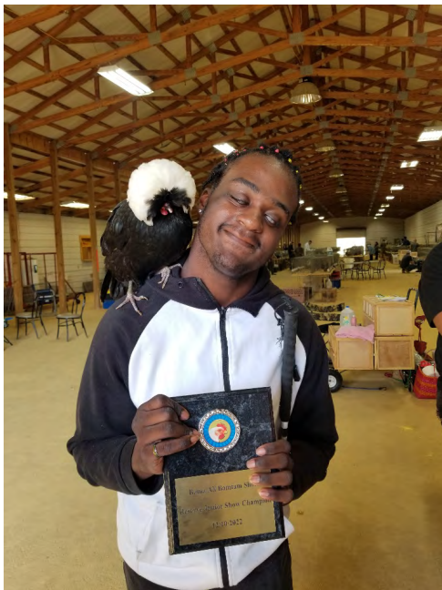
Student with a Polish Hen

Note. The student won as a reserve show champion Fall of 2022.