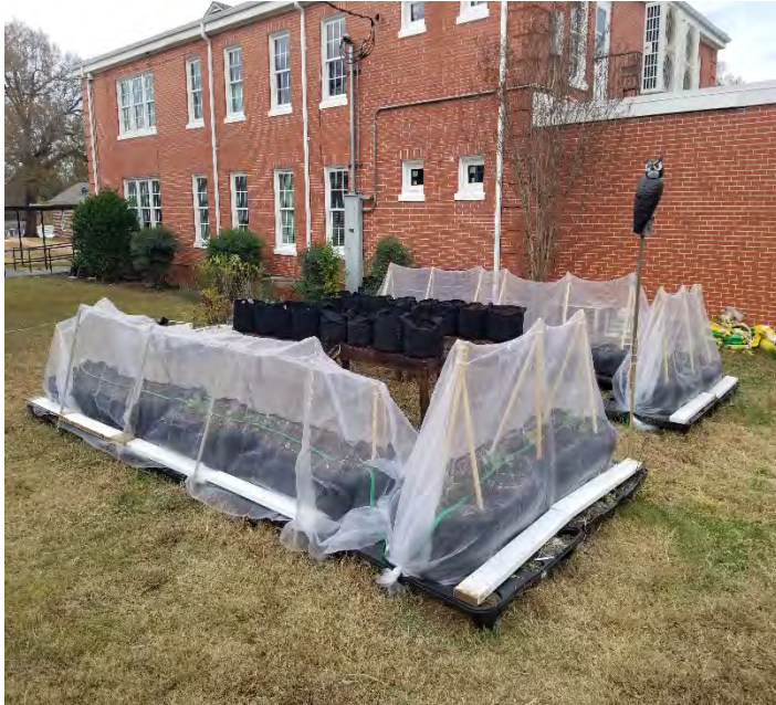
Raised Garden Beds outside ASB

Note. Black felt grow-bags are used for higher safety and contrast.