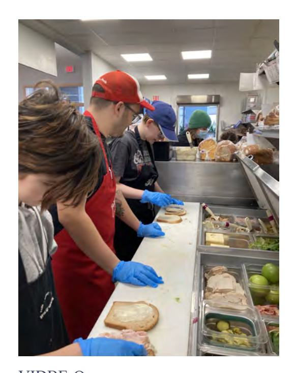
Figure 4 Making Sandwiches

Taking a RISK is just one of many ways ECC is addressed in such a rural state. There are many students who will never have that opportunity if we as a system do not deliver that instruction to them in a way that is experiential and meaningful. We bring them up close and personal. We have taken students to music schools to show them up close what a violin is and the sound it makes, to ice cream shops to see how the ice cream is made, to the state house to meet a state senator and see where laws are created. We have set up volunteer opportunities where our students can help someone else and learn what it is like to give back to others and be appreciated.