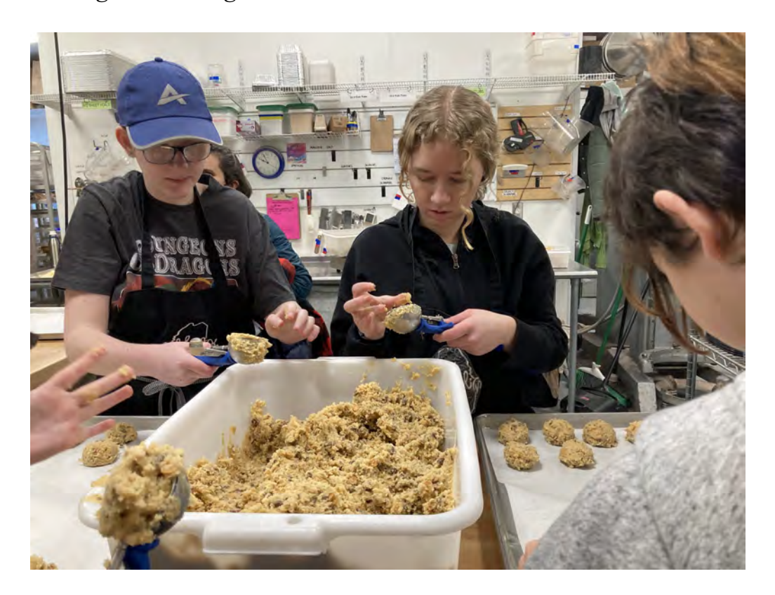
Figure 5 Making Some Dough

Another program DBVI offers is for middle and high school students to participate in a monthly career exploration group to help build career awareness and explore jobs in a hands-on way. Blindness Rehabilitation Specialists, VR Counselors, and O&M Specialists facilitate the group. Each month the group visits a different employer, receiving a tour of the worksite and learning about the range VIDBE-Q Volume 69 Issue 3