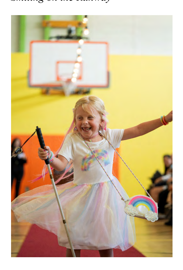
Figure 3 Smiling on the Runway

On Saturday, April 27, 2024, twenty-three models ranging in age from infants to high schoolers arrived at FBC's Central Phoenix campus. Participants