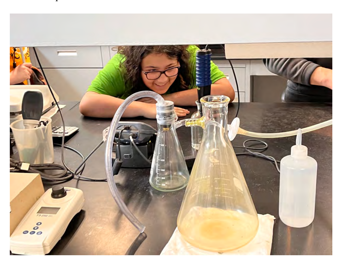
Figure 3 Science Experiments

responsibility for a chore, keep track of progress through a chore chart that they developed and had signed off by a parent or guardian, and earn a reward of a recreational activity which they had to research and plan. The program has been repeated multiple times in various locations and it has been adjusted to meet the needs of the current group of students. Many students travel long distances to attend. Transportation can be arranged to support a youth to participate.