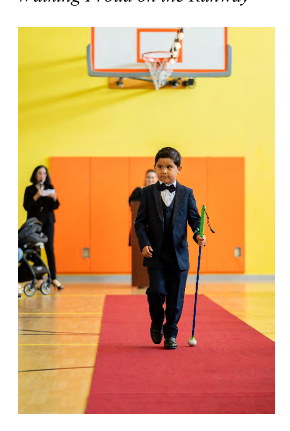
Figure 1 Walking Proud on the Runway

The Fashion Show also presents additional opportunities to practice selfdetermination through problem-solving.