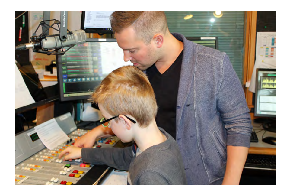
Figure 7 At the Radio Station

One of the most rewarding things about working with students in Maine is the ability to collaborate so closely with colleagues who share the same passion. Though Maine is a state with a small population spread across a wide geographic