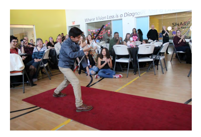
Figure 5 Fun on the Runway

Some of our favorite memories include a twelve-year-old student who, when he reached the end of the runway, turned his cane into a prop guitar and started jamming out. It got huge applause and was truly a creative move by the student.