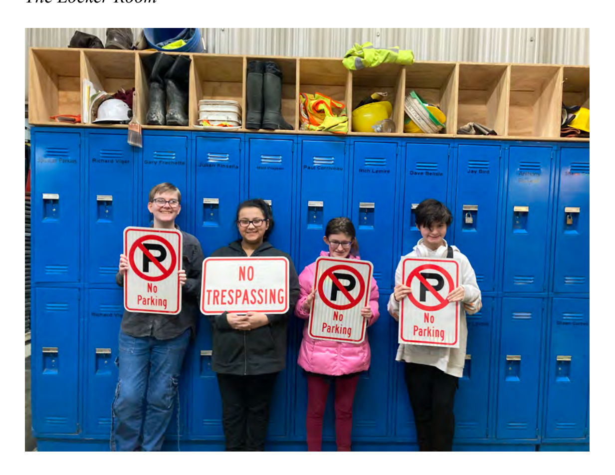
Figure 1 The Locker Room

Catholic Charities Maine's Education Services for Blind and Visually Impaired Children (ESBVIC) provides early intervention through proactive, VIDBE-Q Volume 69