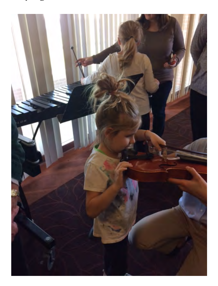
Figure 2 Playing Music

Maine provides an innovative program for youth called Taking a RISK (Responsibility and Independent Skills for Kids). Taking a RISK is planned and executed by a group of TVI's and O&M's and focuses on children ages 7-14 and teaches skills such as setting the table, making a snack, sweeping the floor, washing dishes, and also sets the expectation that the child would complete one chore on a regular basis. Once the skills are taught the children are expected to take