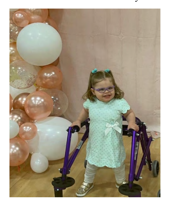
Figure 2 A Preschooler on the Runway

Moments for students to handle challenges and practice being flexible and adapting in the moment. Sometimes the music stops, there are delays in the timing or the show schedule, or maybe even an unexpected obstacle on the runway, such as a sibling running onto the runway.